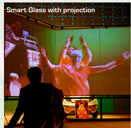
Smart Glass with projection

the SMART GLASS company the next generation in glass privacy