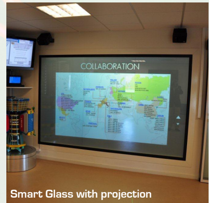
Smart Glass with projection

"Smart Glass provides a simple and cost effective alternative to other Switchable Glass technologies".